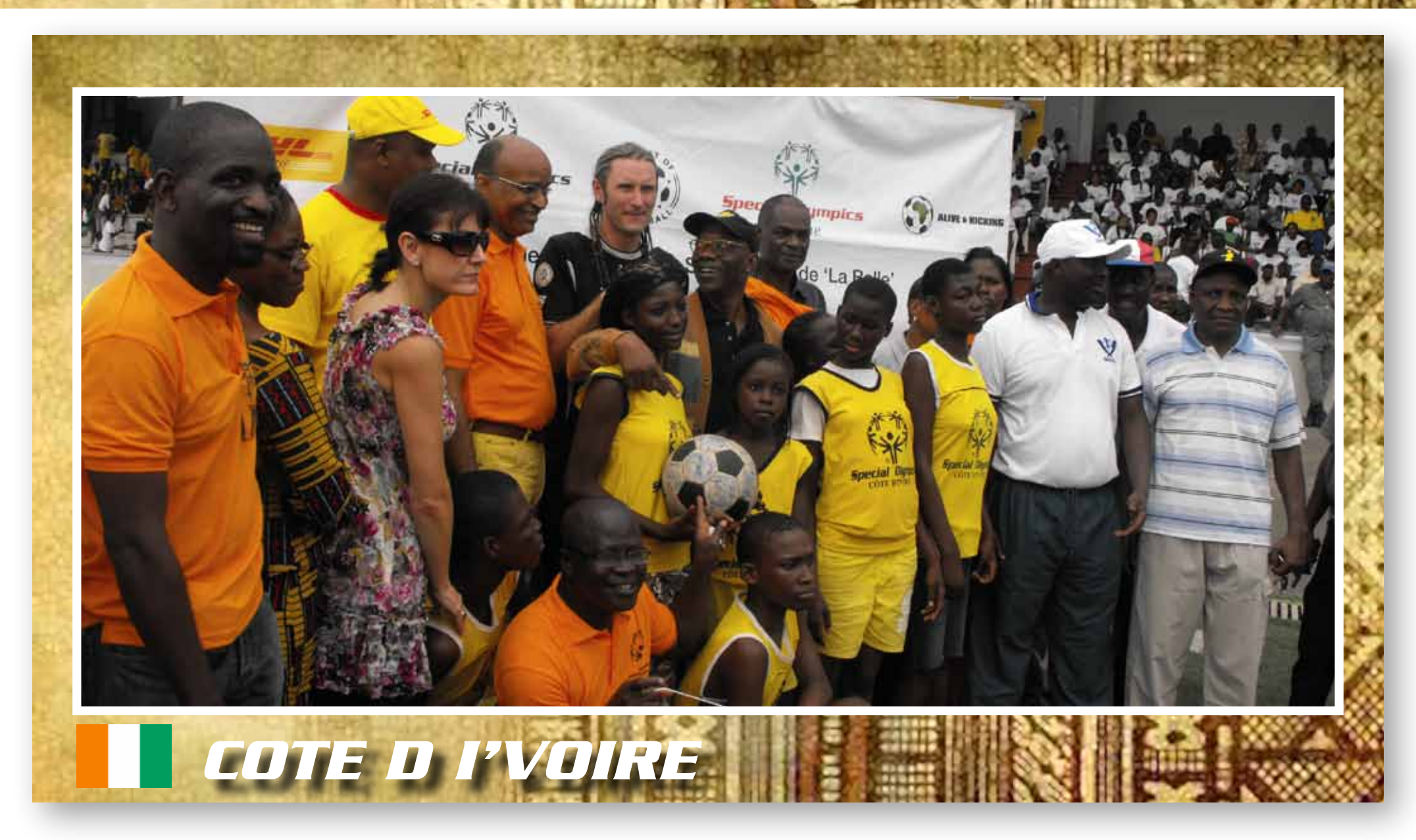
Special Olympics Burkina Faso enthusiastically welcomed The Ball with the team from DHL.