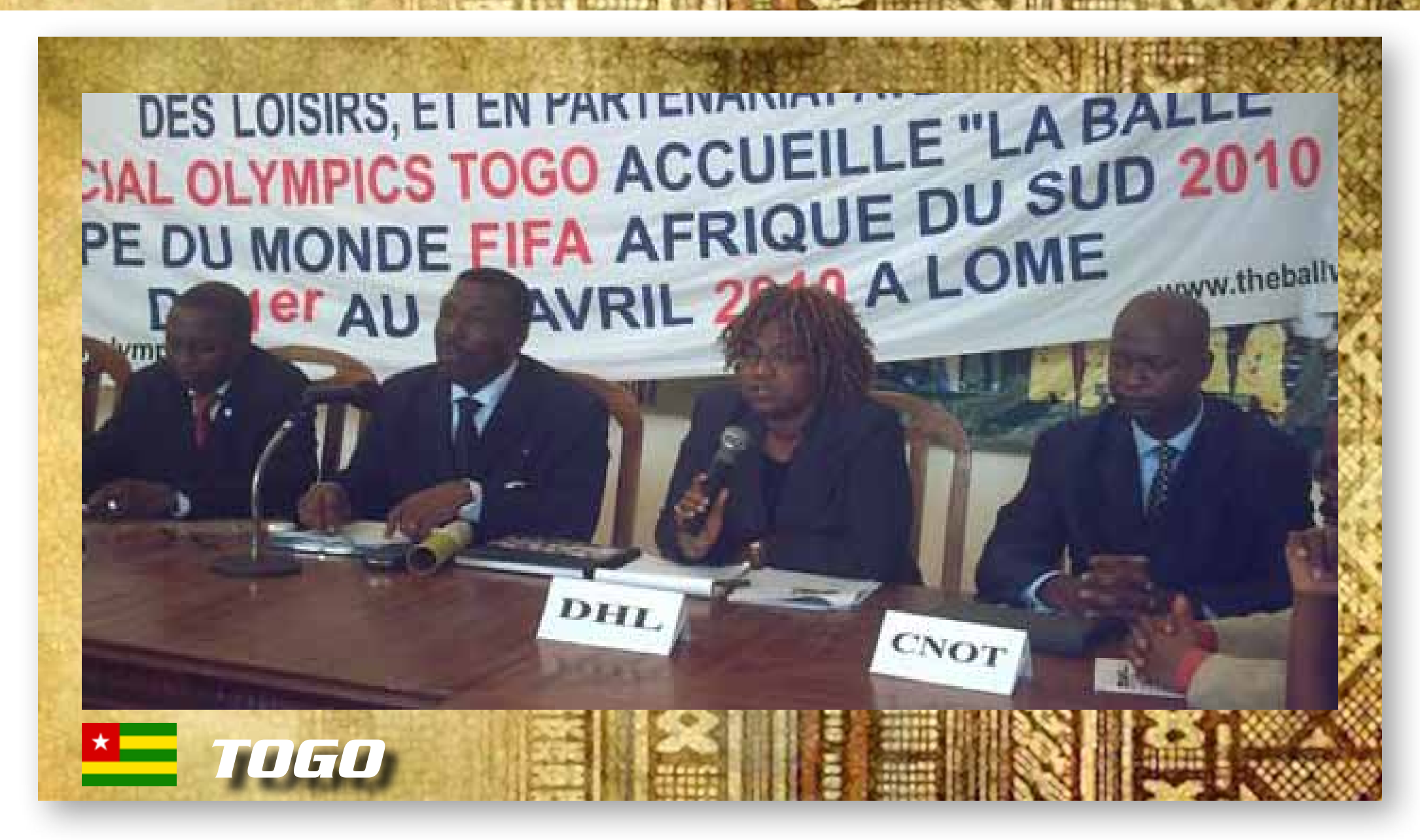
Special Olympics Togo and DHL welcomed The Ball at the border.