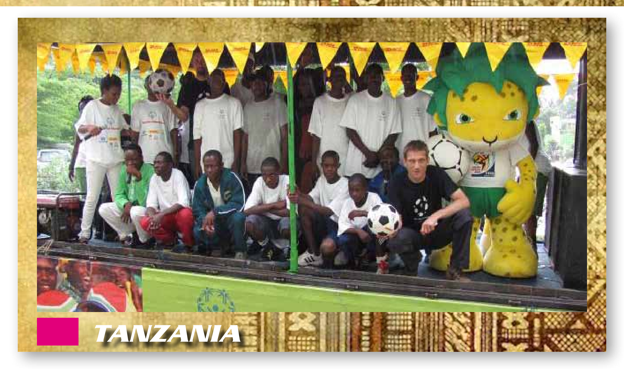
Special Olympics Tanzania ran an extensive media campaign prior to the arrival of The Ball.