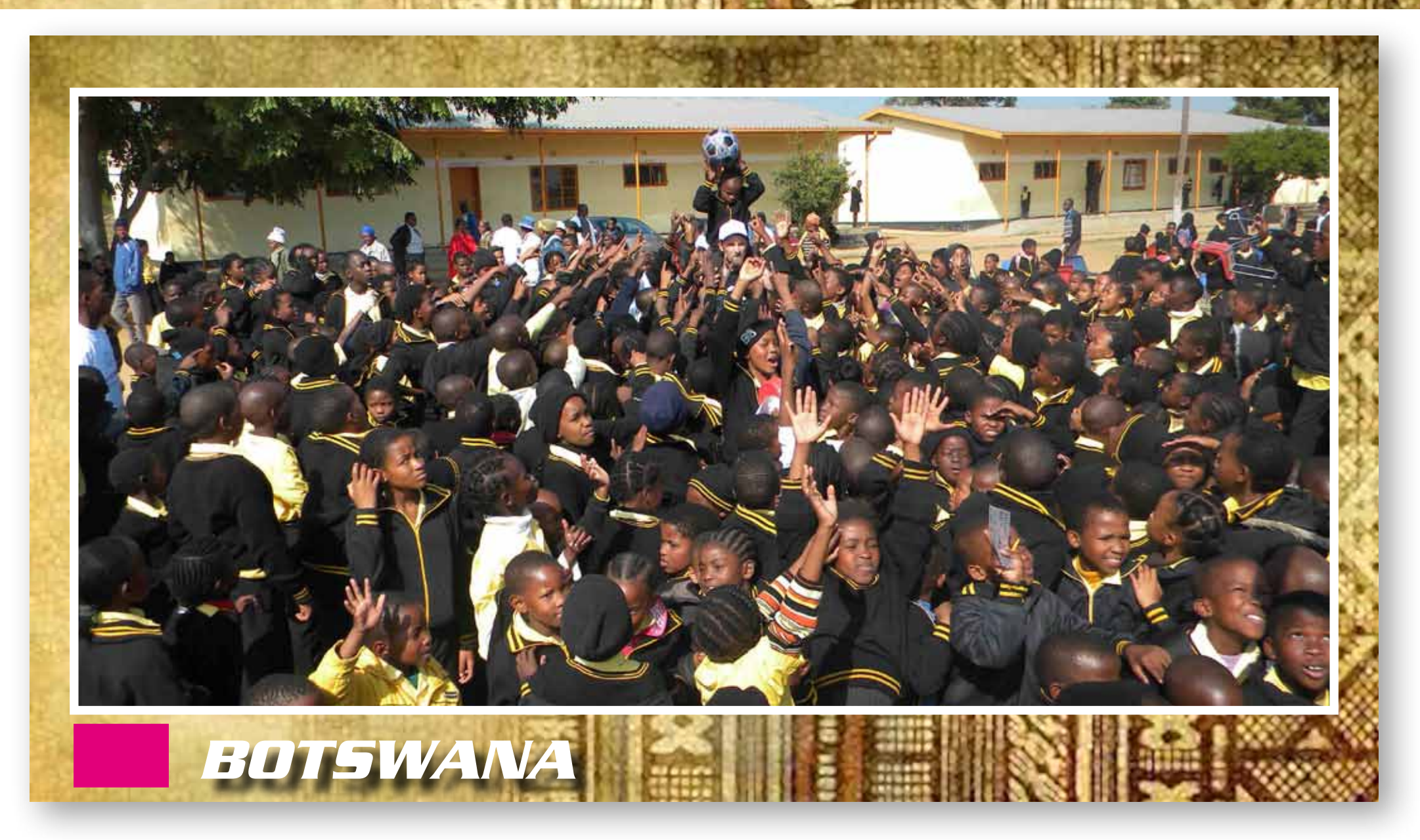
Special Olympics Botswana did an official media launch of The Ball well ahead of its arrival.