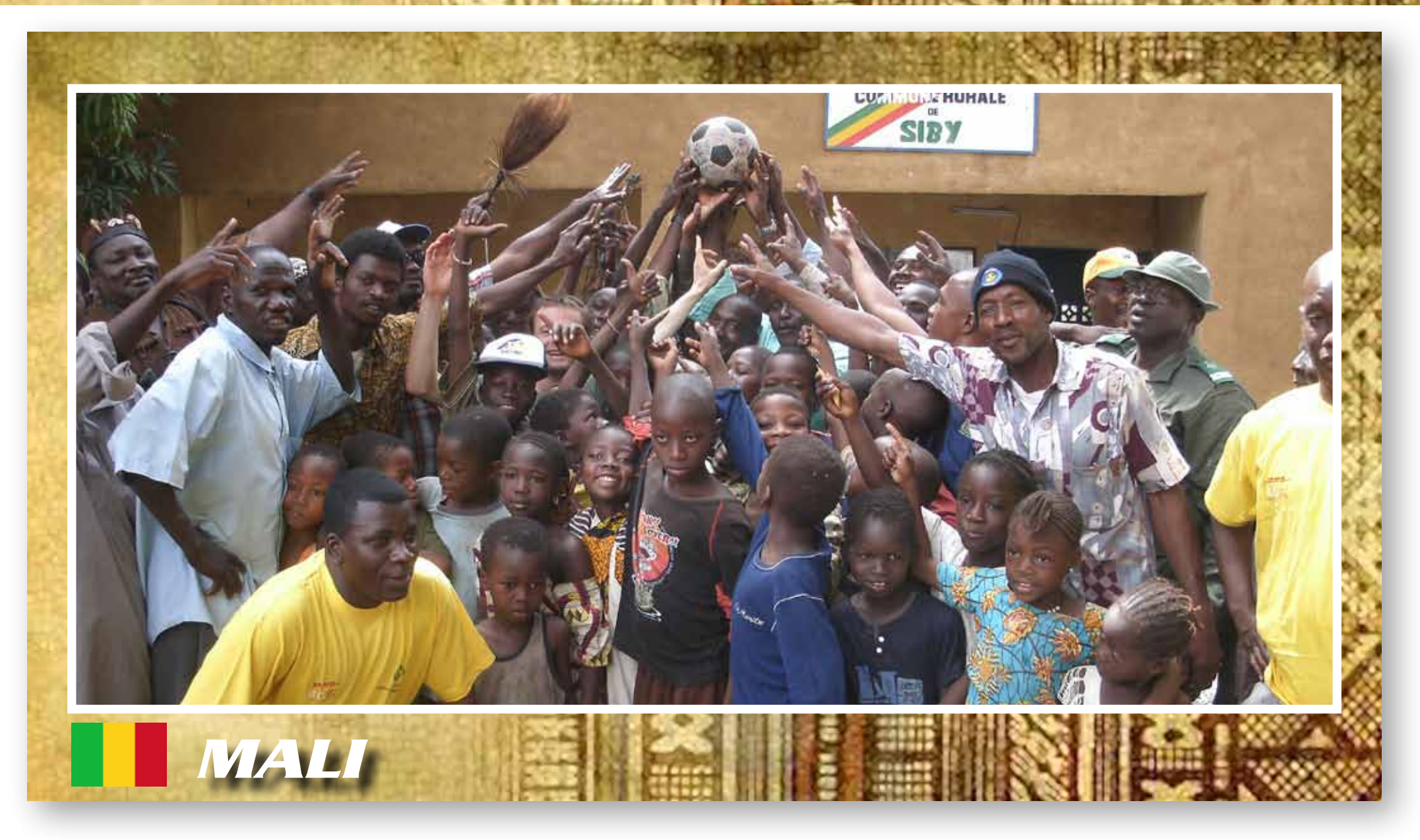
The Ball was officially received in Mali at a reception sponsored by the Minister of Sport where it was presented to political and sports officials.