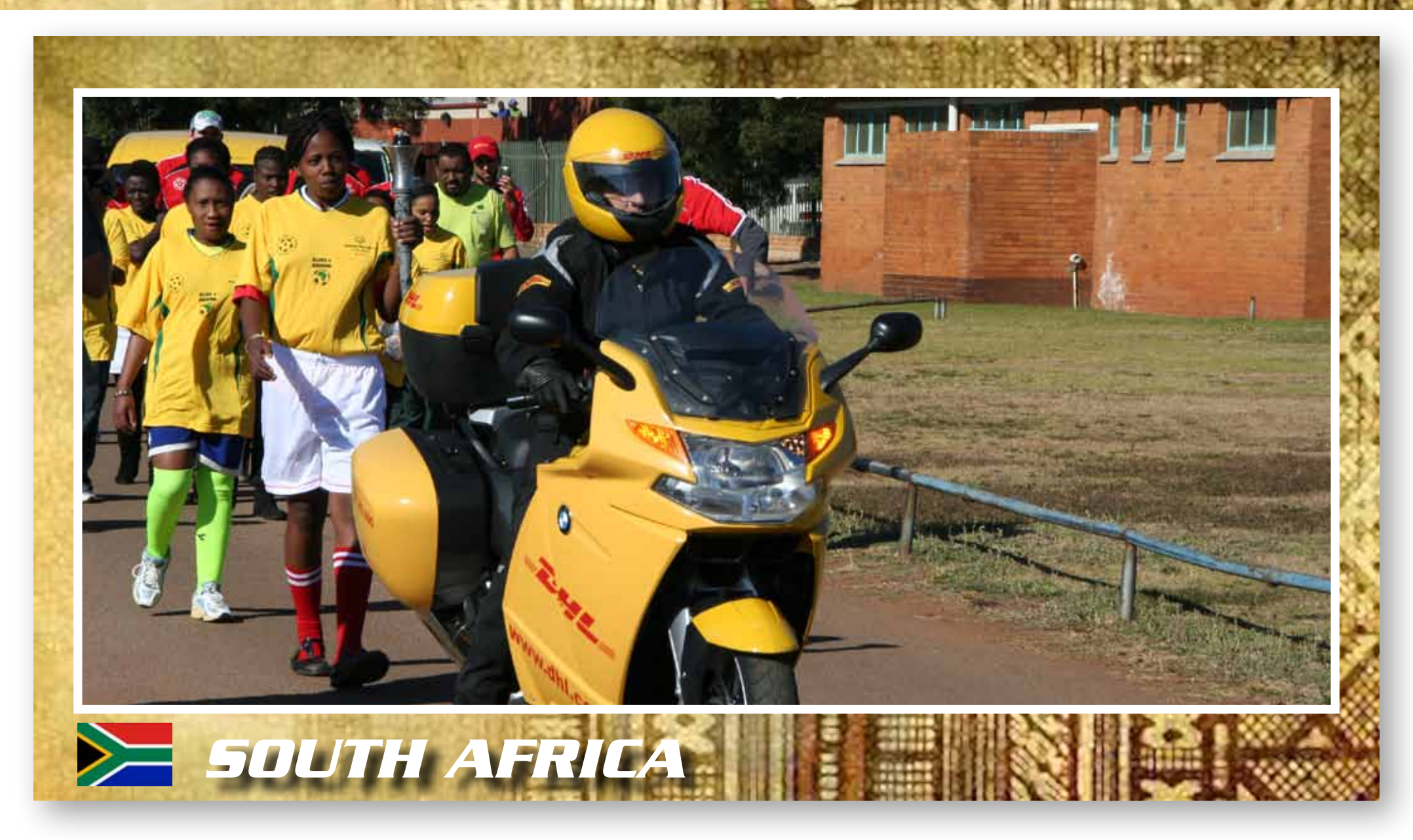
Special Olympics South Africa held one key event as The Ball arrived mere days before the opening ceremony of the 2010 FIFA World Cup.