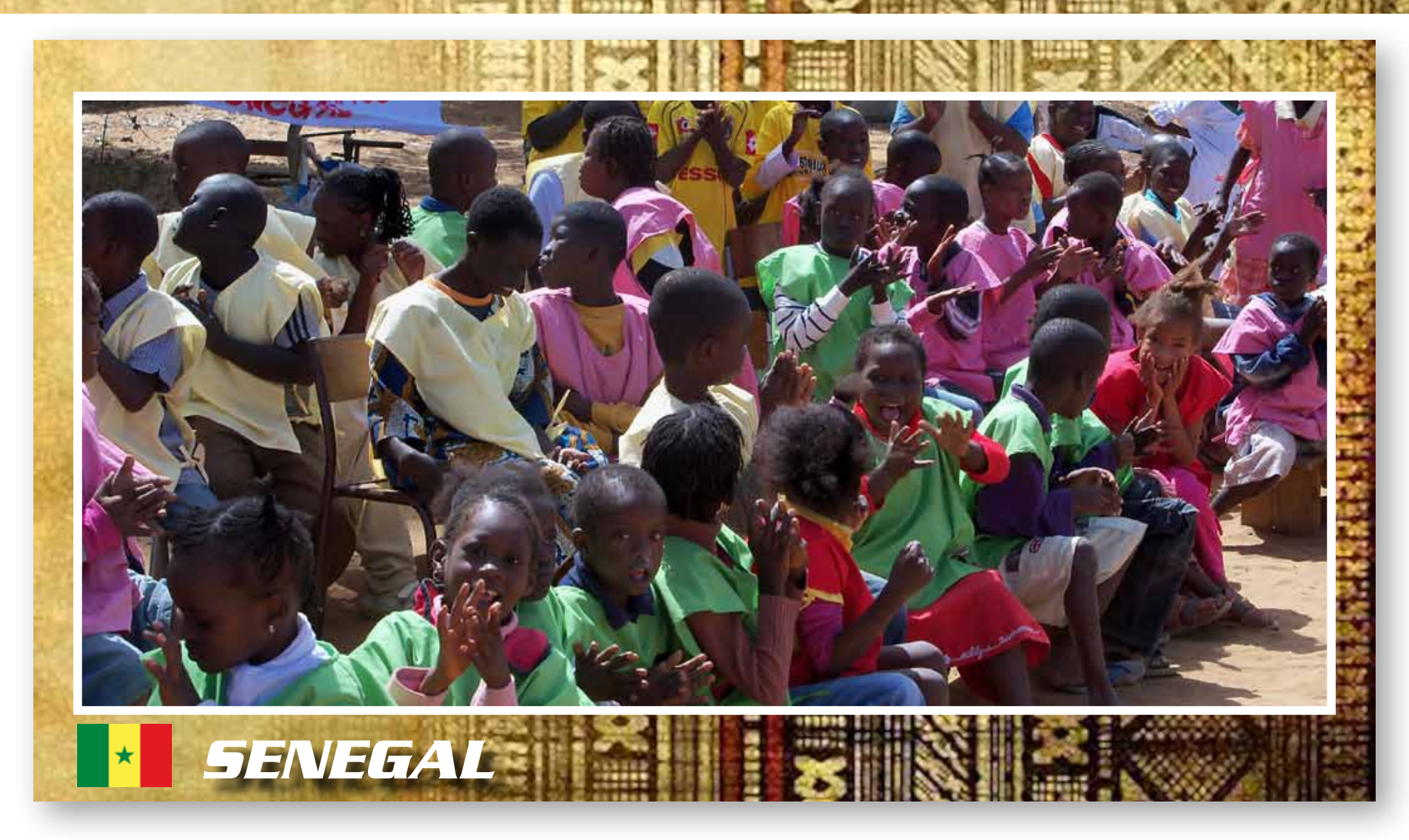
Senegal was to first Special Olympics program country to welcome The Ball on its journey through Africa.