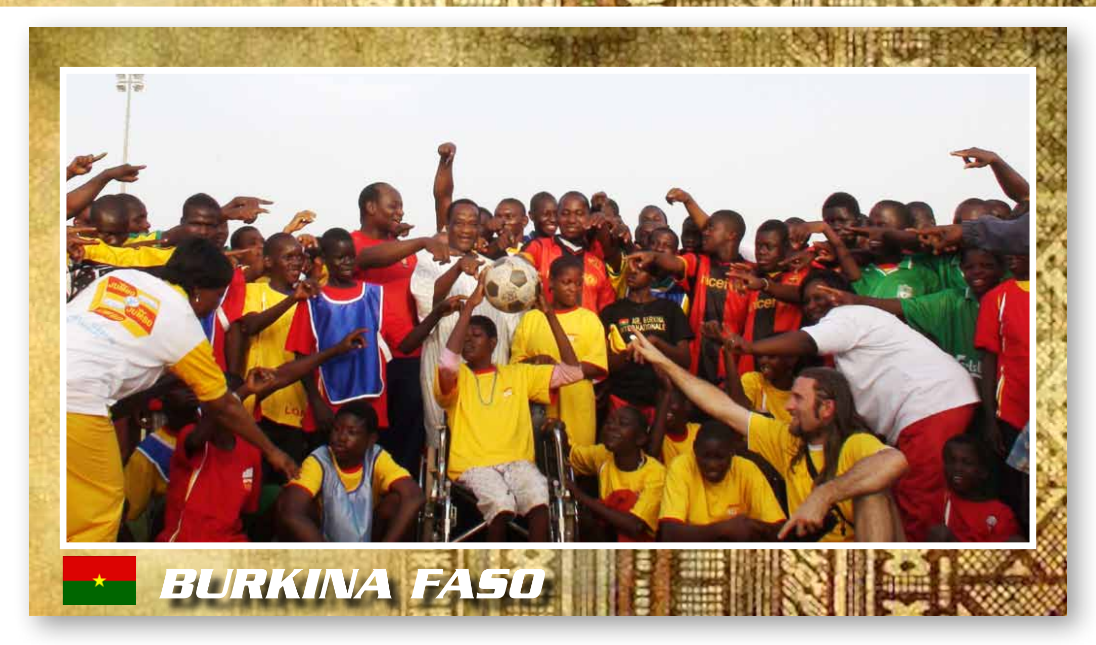
Special Olympics Burkina Faso enthusiastically welcomed The Ball with the team from DHL.