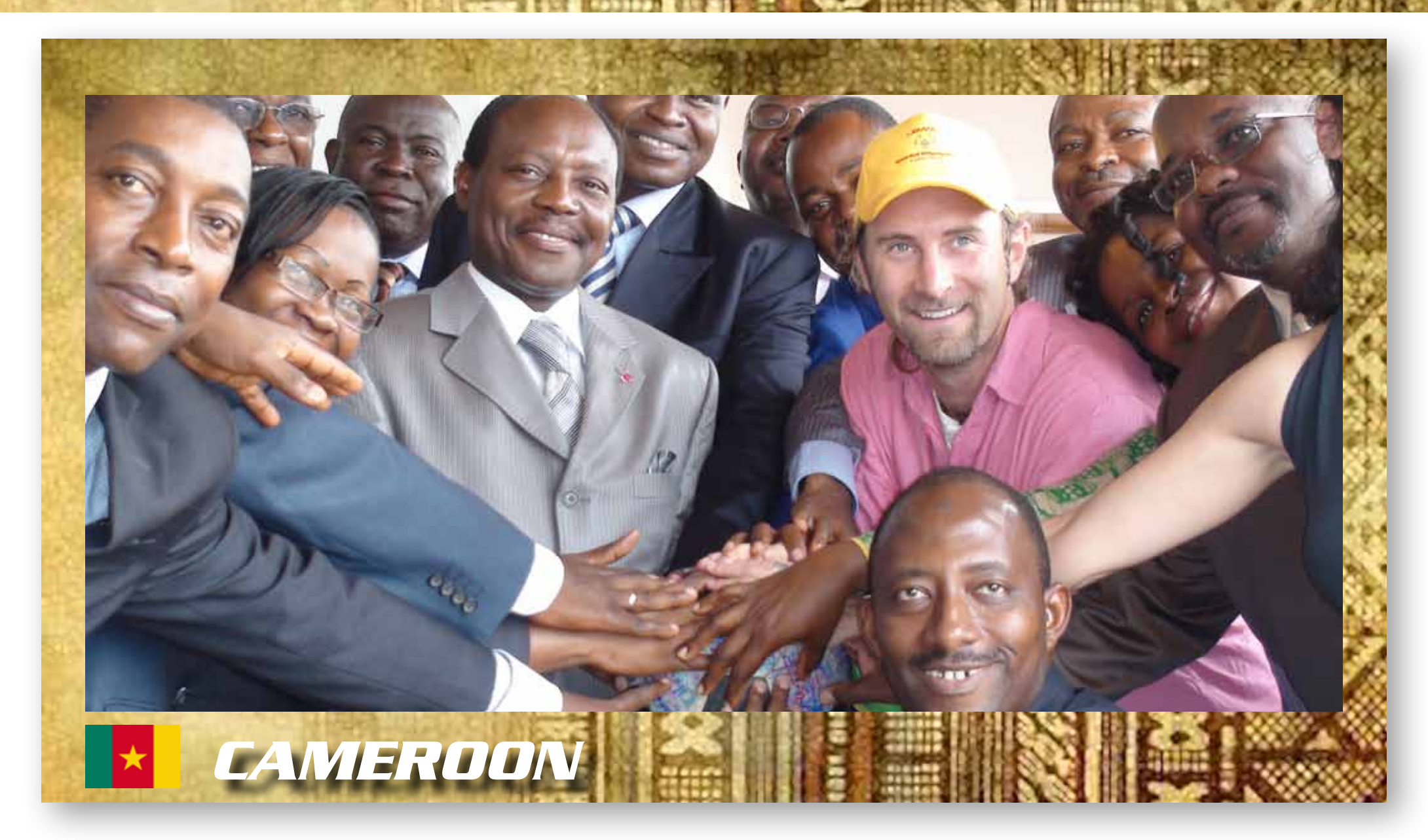
DHL Cameroon met The Ball in Douala and then transported the team to Yaounde for an official welcome at the DHL office.