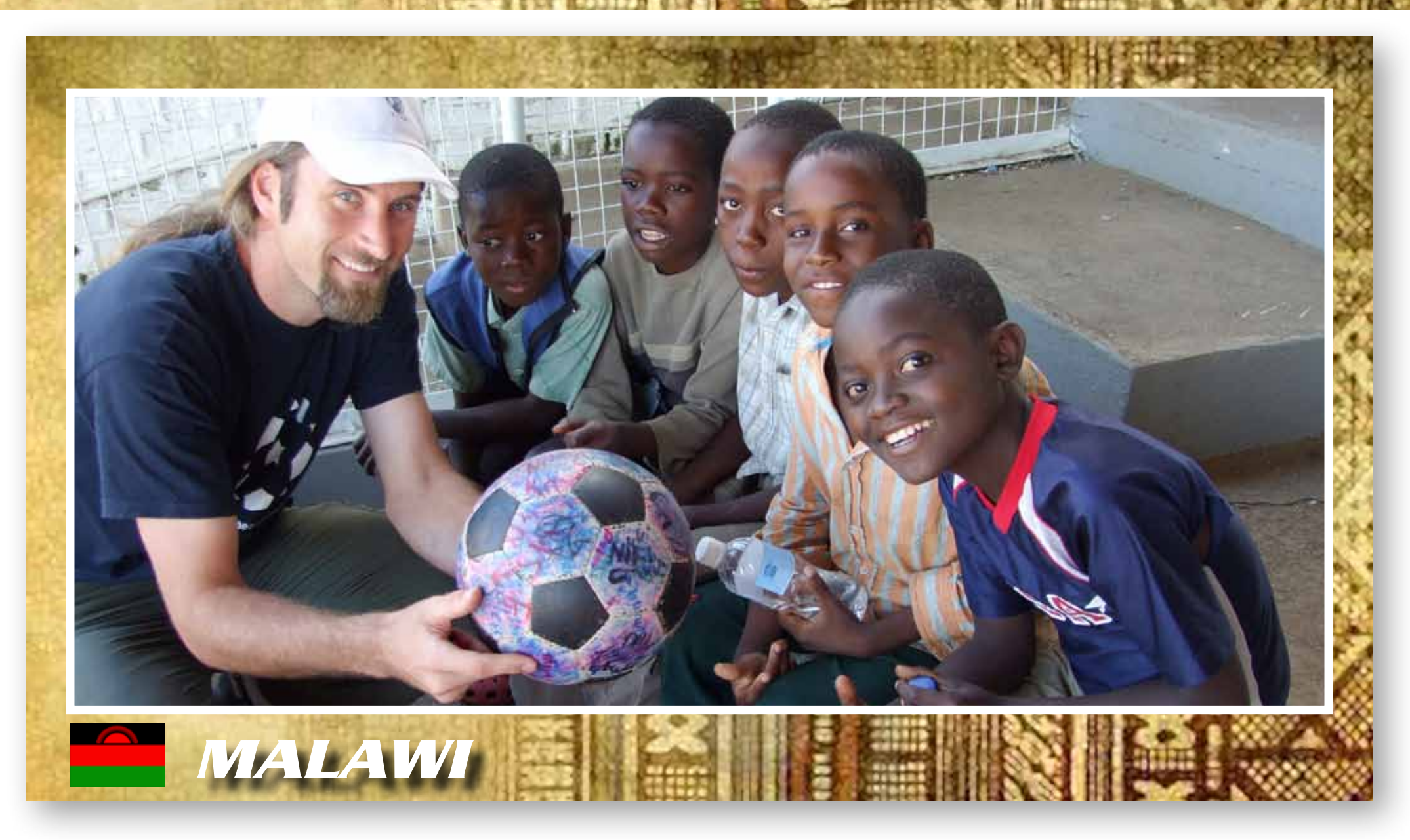
In Malawi the celebration of The Ball's arrival started with a ceremonial walk from the Malawi Polytechnic to Kazuma Stadium.